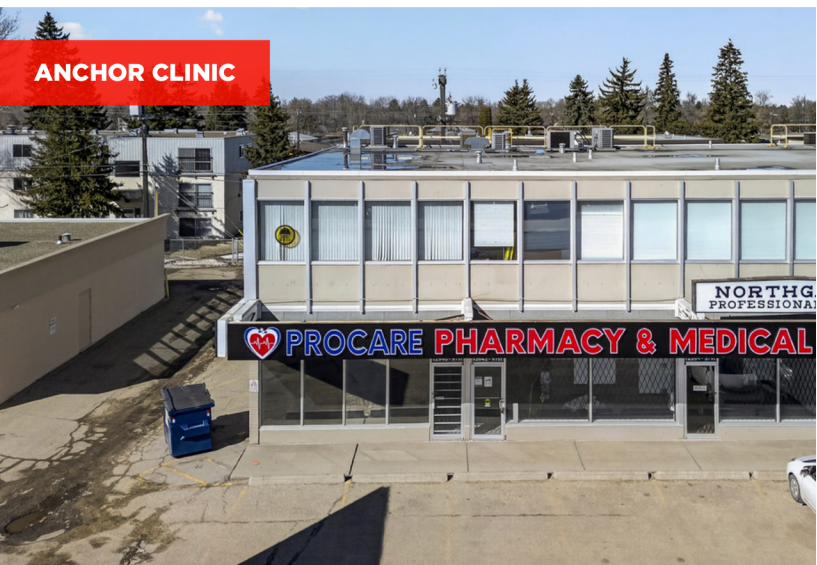
Pharmacy & medical frontage.