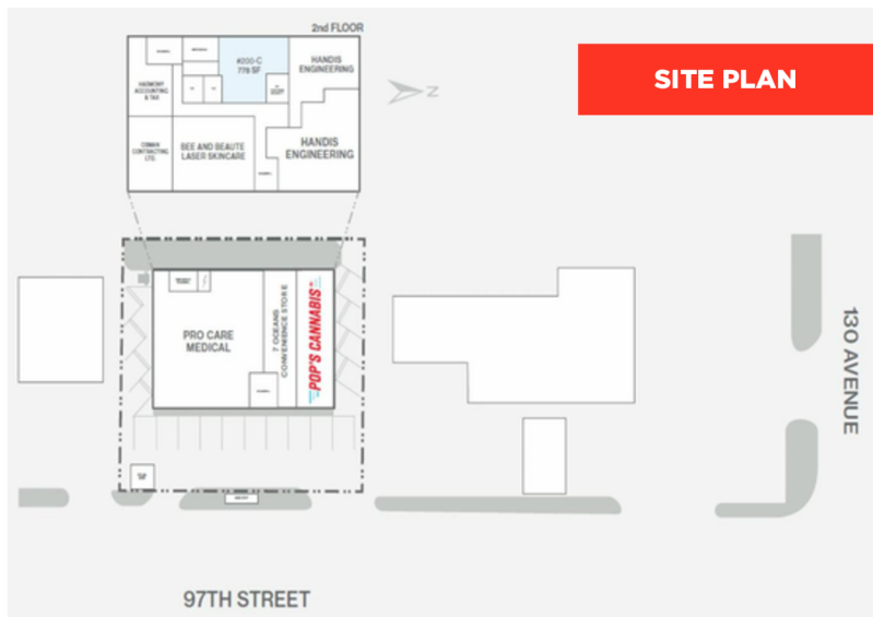
Ground floor retail and second floor office layout.