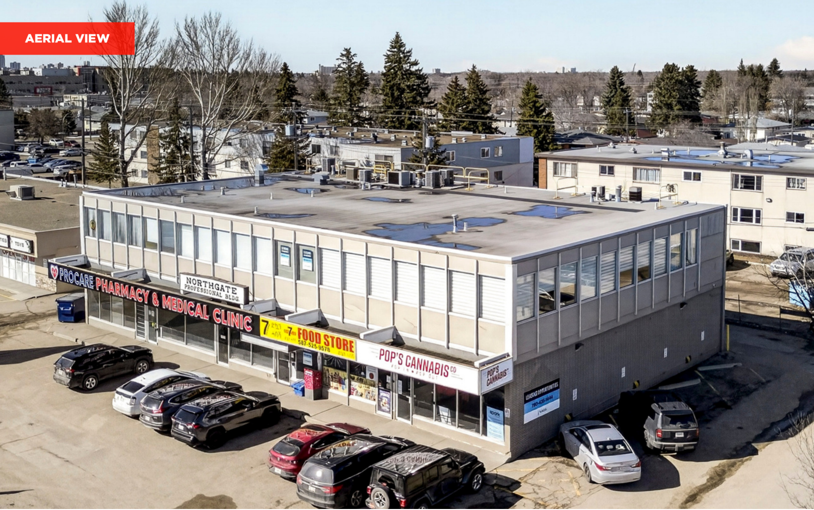
North elevation with full retail signage band and surface parking field along 97 Street NW