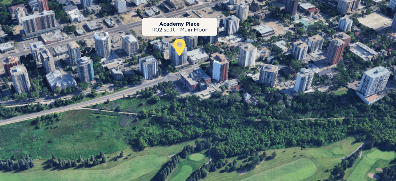
Academy Place 1102 sq.ft - Main Floor